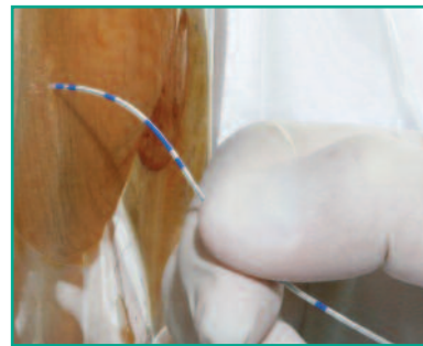
Easy insertion and removal with reduced threat of breakage or uncoiling with the spring embedded in polyamide