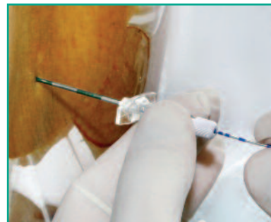
Easier to advance to minimize the incidence of catheter repositioning for better analgesia quality