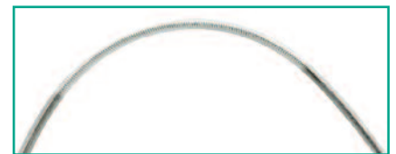
Flashback windows (distal and proximal)

READ WHAT USERS THINK ABOUT THE PERIFIX FX AT www.perifixfx.bbraunusa.com/FX